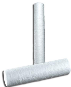
Figure 1: Hytrex Depth Cartridge Filters