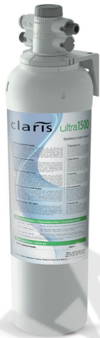
Head sold separately.

Claris Ultra 1500-XL Filter Cartridge: EV4339-83